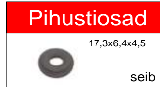
RTM 53 098 = 9415676 Opel, Isuzu