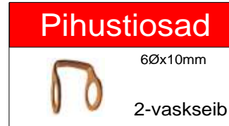
DP 15 055 DTP 31 065 = MAN