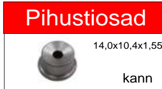
RTM 53 091 DTP 31 000 = 4279493 Fiat, Sofim, Iveco