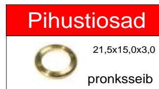
RTM 53 143 DTP 31 120 = 11176-56010; 11176-77010 Toyota