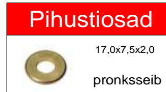
RTM 53 147 = 11176-56030 Toyota