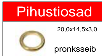
RTM 53 145 DTP 31 121 = 111760-36010 Toyota