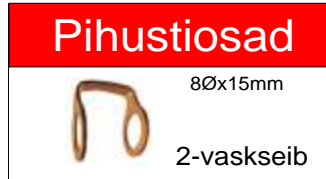
DP 14 797 DTP 31 040 = MB