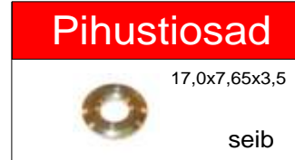
RTM 52 392 = Toyota