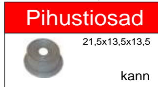
RTM 53 103 = 198204 Fiat, Renault, Peugeot