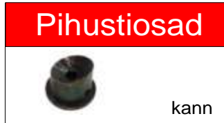
RTM 53 095 = 751966 Fiat