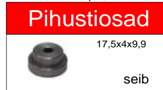
RTM 53 105 = 11176-67076 Toyota Land Cruiser 3,0 4-sil