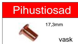
RTM 53 142/20 DTP31560 = A 90601707760 MB Atego, Citaro, Axor