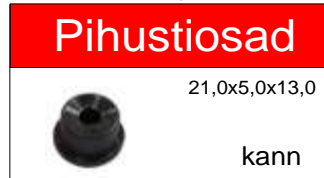
RTM 53 097 = 1177604455 Chrysler, Rover