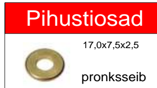
RTM 53 146 = 11165-56020 Toyota