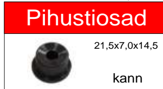
RTM 52 092 DTP 31 002 = 1501934 Ford Transit