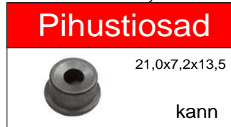
RTM 52 093 DTP 31 003 = 821701 Opel=Bedford