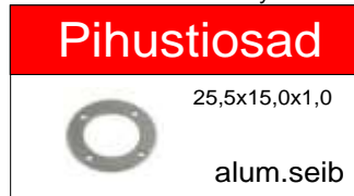
RTM 53 187 DTP 31 025 = 50623-190 Toyota, Daihatsu, Kubota