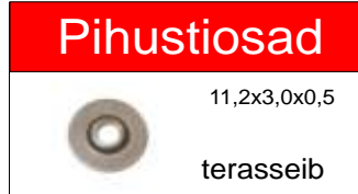
RTM 53 189 = 5600661508 Fiat Ducato 2,8D PSA