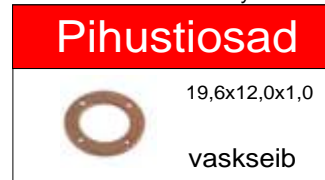
RTM 53 186 DTP 31 031 = 3456258 Mada, Opel, Isuzu, Kubota