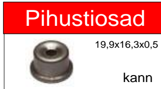
RTM 53 101 = 7700858971 Renault Megane, Laguna