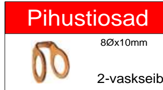
DP 14 798 DTP 35 050 = MB