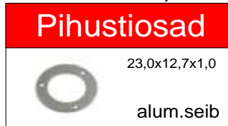
RTM 53 185/3 Y3 = 093245-0040 Toyota, Daihatsu