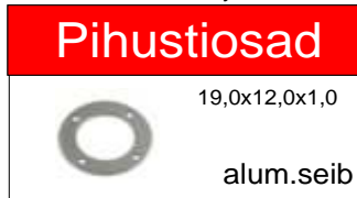
RTM 53 184 = 23654-46010 Mitsubishi, Toyota