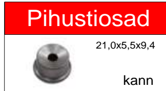
RTM 53 096 = Fiat