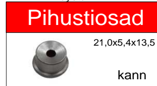
RTM 52 094 DTP 31 004 = 198105 Peugeot