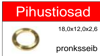
RTM 53 144 DTP 31 122 = 11176-64010 Toyota