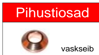
RTM 53 142/5 DTP 31 017 = 943776230 Isuzu