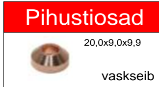
RTM 53 106 = 711220 Lamborghini