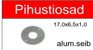
RTM 53 188 = 1117-56030 Isuzu