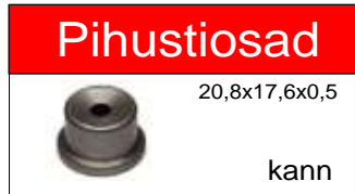
RTM 53 102 = Peugeot, Ford, VM