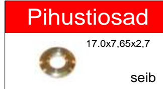
RTM 52 390 S35 = 7111-17010 Toyota